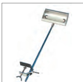
Reflector cu brat 300W EUR 35.00 Cod 019.010.200.010