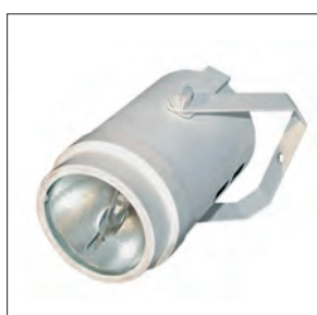
Reflector HQI 80W EUR 35.00 Cod 019.010.200.030