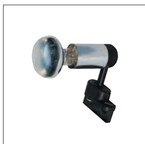
Lampa spot 100W EUR 12.00 Cod 019.010.188.000