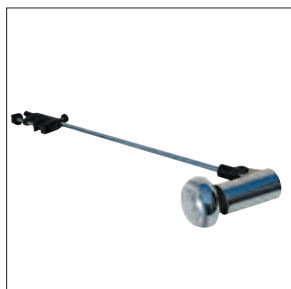
Lampa spot cu brat EUR 12.00 Cod 019.010.180.000